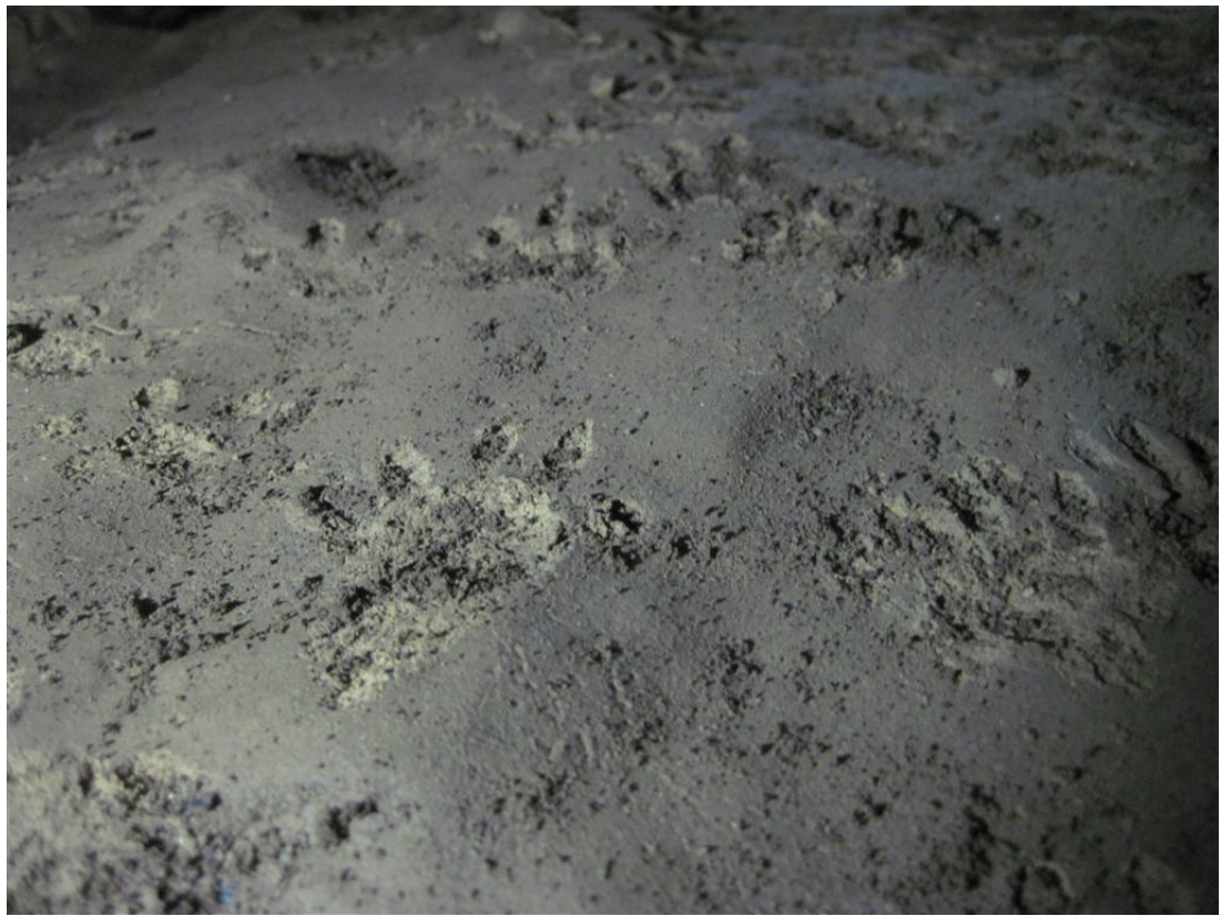
Raccoon tracks in Towards Boundless Passage.

ever drilled into. I used up almost an entire battery and many minutes to drill a single 3/8 hole 11-inches deep. All of the rock dust was sucked horizontally into the lead and disappeared.