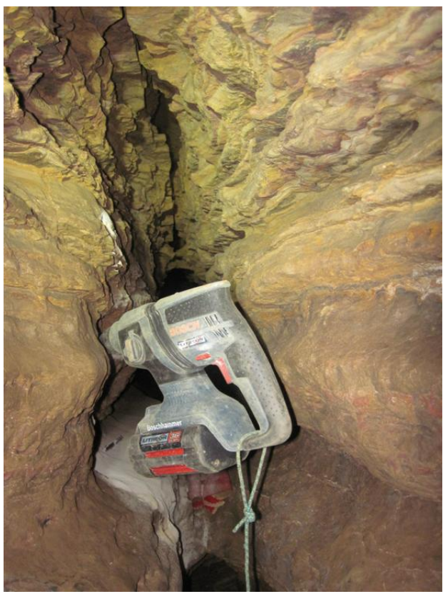
Drill in the squeeze. Note rock dust covering passage beyond. (Yvonne Droms)

The canyon had good air and looked out into blackness, but we couldn't fit through the initial squeeze. This was only a minor inconvenience since we had widening supplies with us, so we set to work. The wind was so strong that it carried rock dust from the drill into the squeeze and deposited it in a fine layer all over the passage. After three shots we were in.